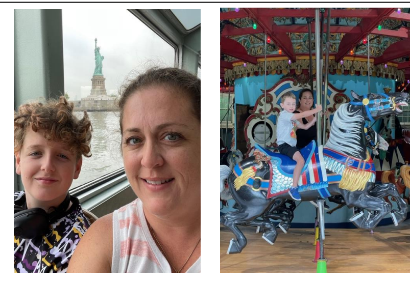
It's Lady Liberty back there!

Wed. July 27 at 10:30 AM- FL DNR Seminar