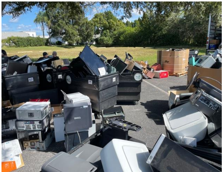
That's a bunch old electronics!

WELCA organized an electronics recycling event that was held in Redeemer's parking lot on Wednesday, October 20th from 10:00 AM to 1:00 PM. Urban Erecycling was on-site and they collected a bunch of unwanted electronics. This event gave our community the opportunity to safely and conveniently dispose of items. Thanks to our volunteers for helping with this busy event. Urban Erecycling had so many items they had to call a second truck to help.