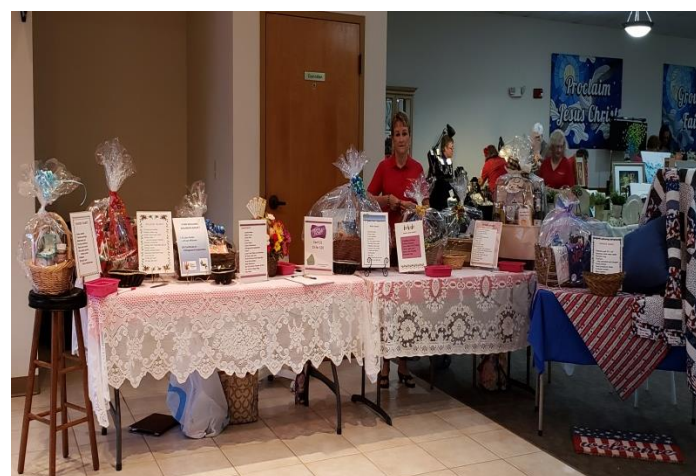
Baskets raffled off by WELCA