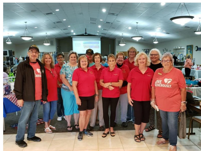
Arts & Crafts Fair Volunteers