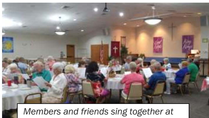
Members and friends sing together at Redeemer on Monday, July 16 th .